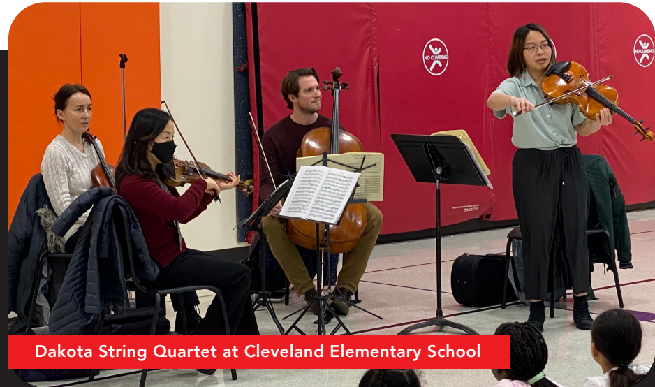
Dakota String Quartet at Cleveland Elementary School