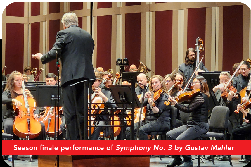
Season finale performance of Symphony No. 3 by Gustav Mahler