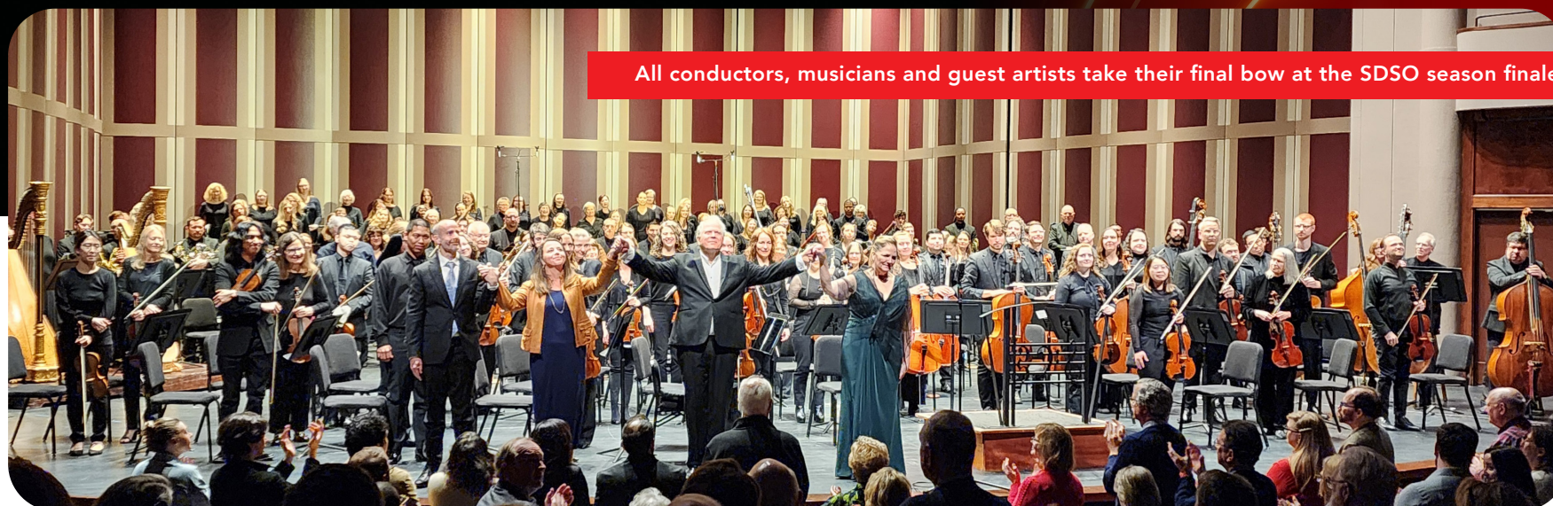
All conductors, musicians and guest artists take their final bow at the SDSO season finale