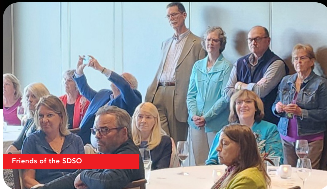
Friends of the SDSO