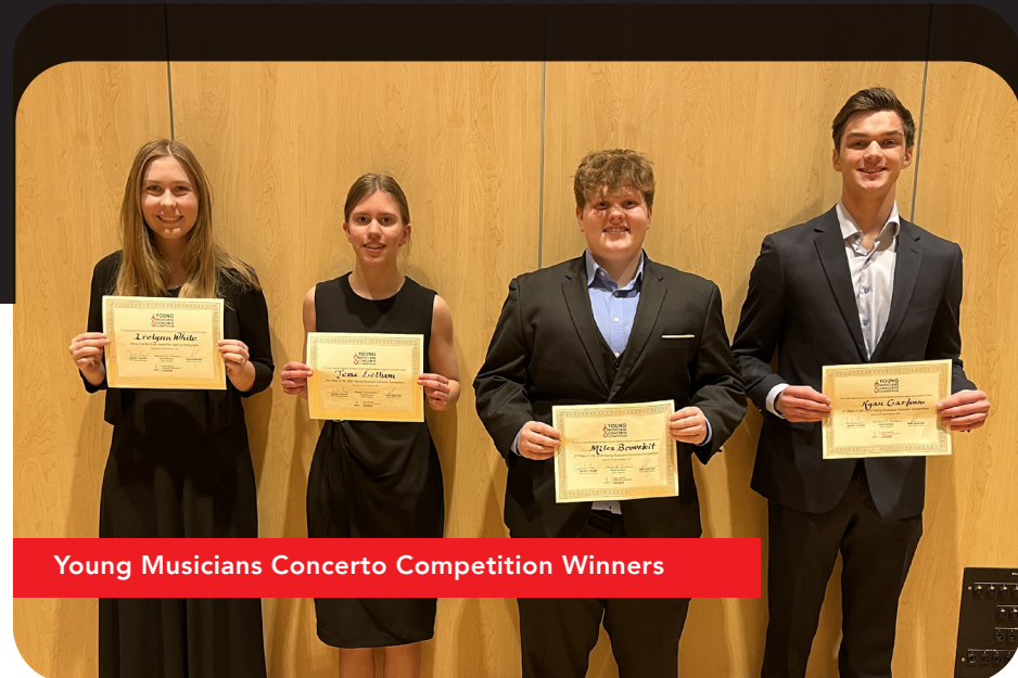
Young Musicians Concerto Competition Winners