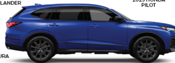
2025 ACURA MDX