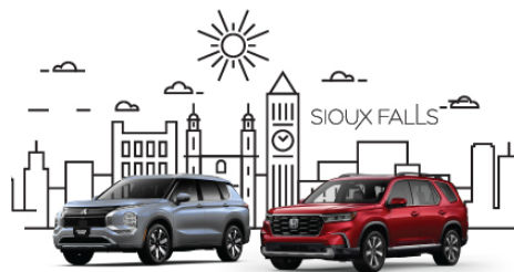
2025 MITSUBISHI OUTLANDER

GIVING BACK TO OUR COMMUNITY - ONE CAR DEAL AT A TIME.